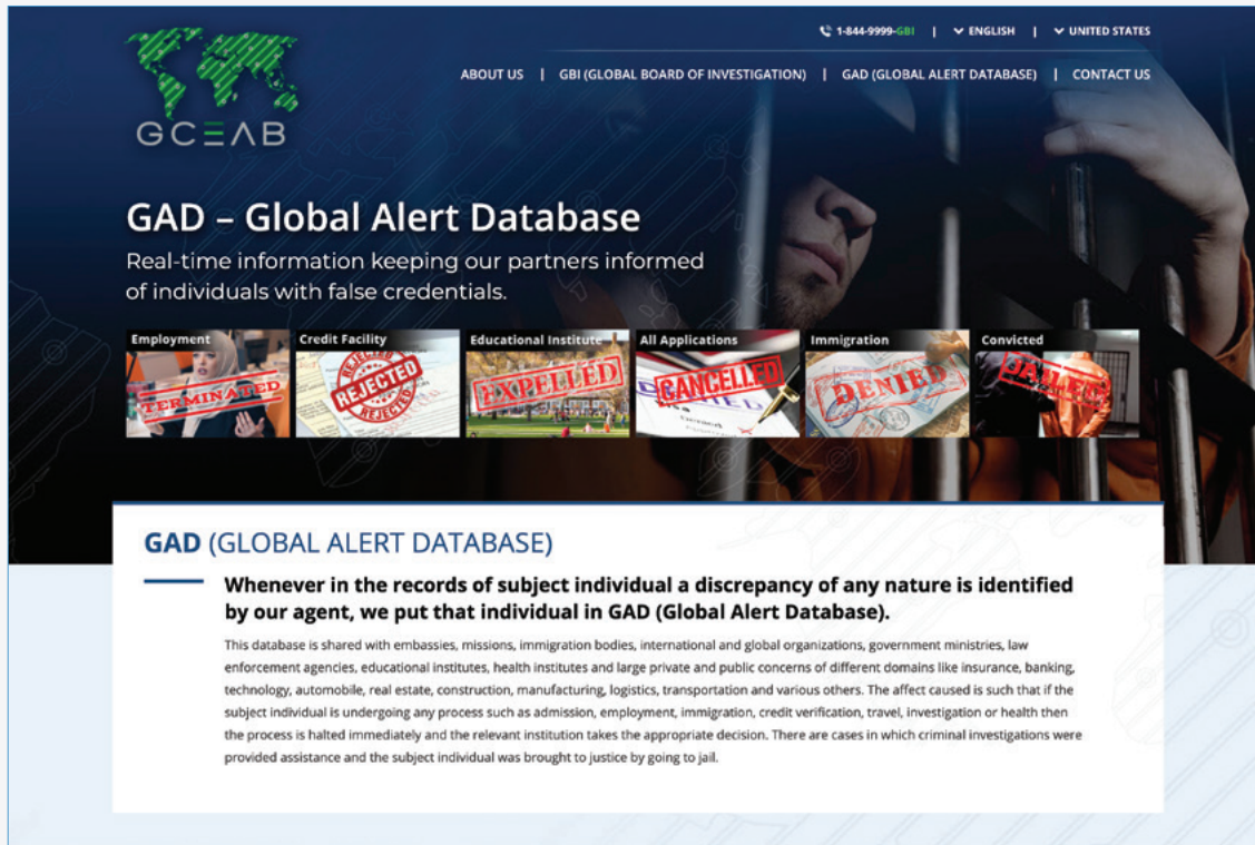
Sample Page from Fake Accreditor/Evaluator’s Website